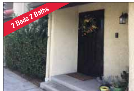
CABRINI VILLAS $699,996 Call 1-800-473-0599, Enter Code 3898