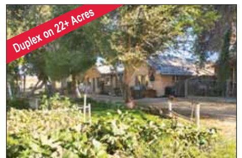
PALMDALE $669,966 Call 1-800-473-0599, Enter Code 3388