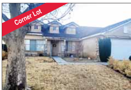
QUARTZ HILL $399,993 Call 1-800-473-0599, Enter Code 3578