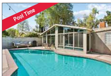
RESEDA $849,948 Call 1-800-473-0599, Enter Code 3728