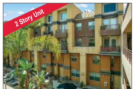
DOWNTOWN BURBANK $828,828 Call 1-800-473-0599, Enter Code 3948