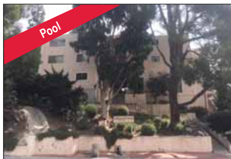
GLENDALE $449,944 Call 1-800-473-0599, Enter Code 3908