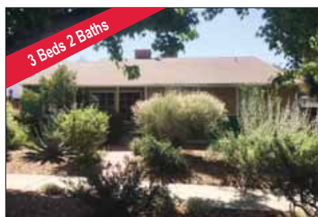
TUJUNGA $999,999 Call 1-800-473-0599, Enter Code 3878