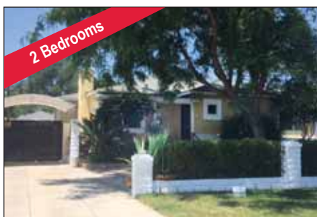
BURBANK $999,999 Call 1-800-473-0599, Enter Code 3968

Who said you can't get anything FREE today? All you do is buy or sell your home with us and you can reserve your date to use the truck the day of your closing. If you have a charitable or community project that needs a truck, call us, we'll let them use it FREE!