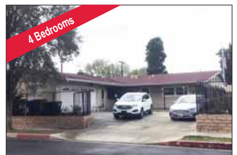
NORTH HILLS $899,998 Call 1-800-473-0599, Enter Code 3588