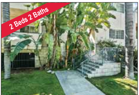
SHERMAN OAKS $799,997 Call 1-800-473-0599, Enter Code 3838