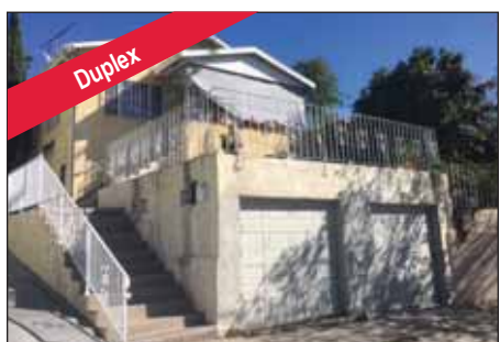
LOS ANGELES $629,926 Call 1-800-473-0599, Enter Code 3638