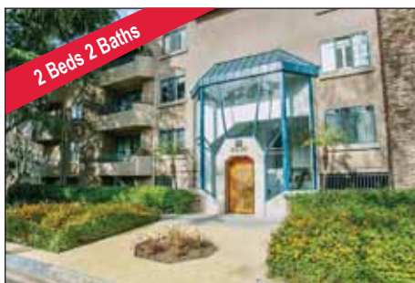
SHERMAN OAKS $869,968 Call 1-800-473-0599, Enter Code 3848