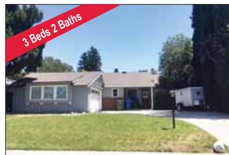
NORTHRIDGE $865,568 Call 1-800-473-0599, Enter Code 3928