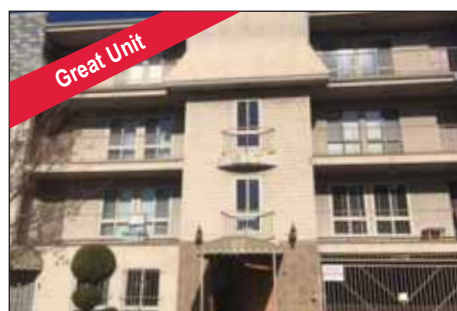
BURBANK HILLS $529,925 Call 1-800-473-0599, Enter Code 3788