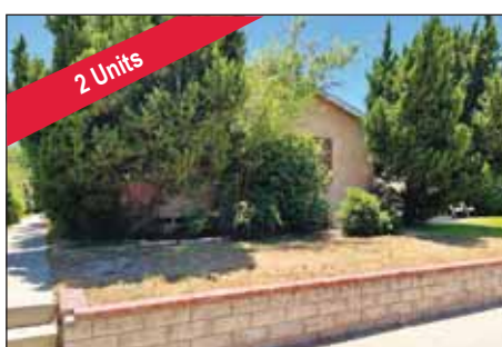
BURBANK $949,949 Call 1-800-473-0599, Enter Code 3998