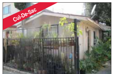
TUJUNGA $269,962 Call 1-800-473-0599, Enter Code 2258