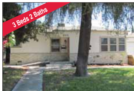
NORTH HOLLYWOOD $529,925 Call 1-800-473-0599, Enter Code 2698