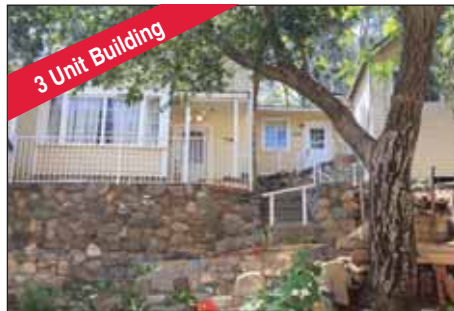
SYLMAR $479,974 Call 1-800-473-0599, Enter Code 2988