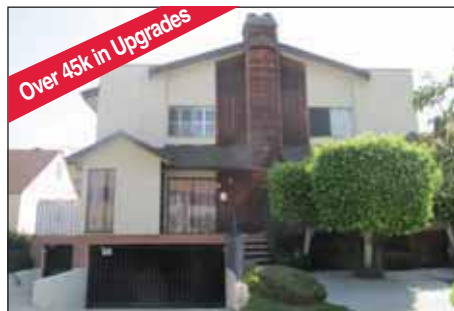
GLENDALE HILLS $424,424 Call 1-800-473-0599, Enter Code 2568