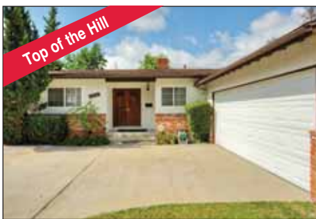
TUJUNGA $569,965 Call 1-800-473-0599, Enter Code 2018

Who said you can't get anything FREE today? All you do is buy or sell your home with us and you can reserve your date to use the truck the day of your closing. If you have a charitable or community project that needs a truck, call us, we'll let them use it FREE!