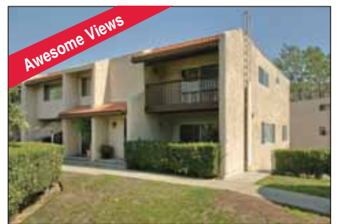
BURBANK $539,935 Call 1-800-473-0599 Enter Code 2128