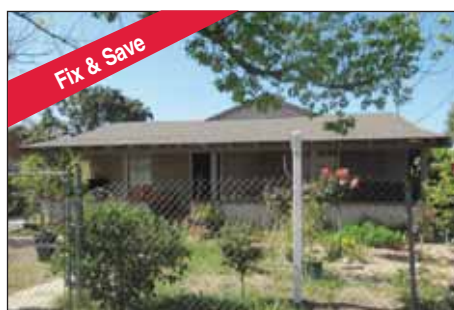
SUN VALLEY $369,963 Call 1-800-473-0599 Enter Code 2588