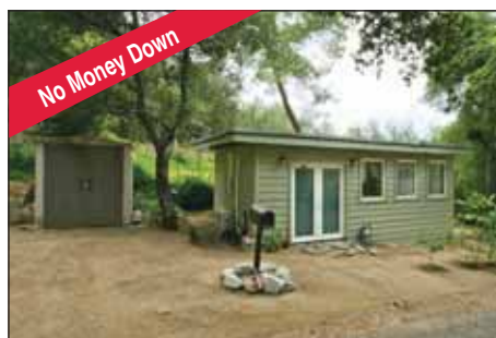
SUNLAND $349,943 Call 1-800-473-0599, Enter Code 3078