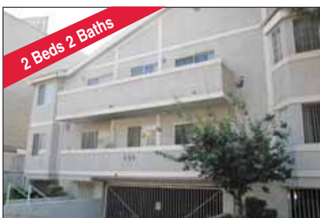
BURBANK $379,973 Call 1-800-473-0599, Enter Code 2828