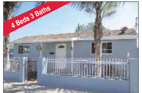
NORTH HOLLYWOOD $399,993 Call 1-800-473-0599, Enter Code 2548