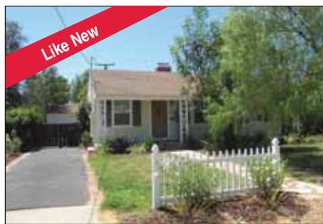
LAKE BALBOA $539,935 Call 1-800-473-0599, Enter Code 3368