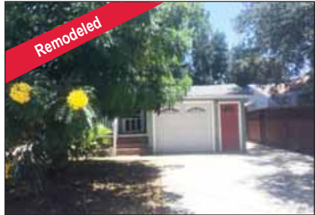
SUNLAND $699,996 Call 1-800-473-0599, Enter Code 2078