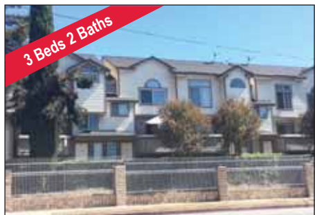
PACOIMA $469,964 Call 1-800-473-0599, Enter Code 2318