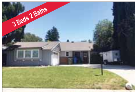
NORTHRIDGE $809,908 Call 1-800-473-0599, Enter Code 3928