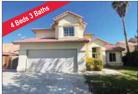
LANCASTER $595,000 Call 1-800-473-0599, Enter Code 2188