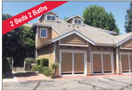
NORTH HOLLYWOOD $559,955 Call 1-800-473-0599, Enter Code 2168