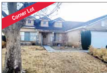
QUARTZ HILL $399,993 Call 1-800-473-0599, Enter Code 3578