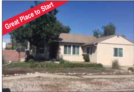
PACOIMA $649,946 Call 1-800-473-0599, Enter Code 2328