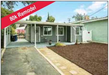
SUNLAND $599,995 Call 1-800-473-0599, Enter Code 2148