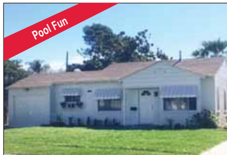
BURBANK $849,948 Call 1-800-473-0599, Enter Code 2088