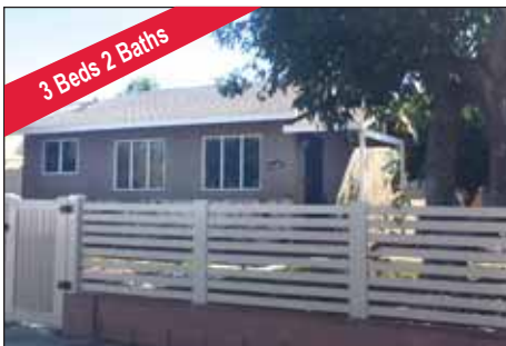
BURBANK $899,998 Call 1-800-473-0599, Enter Code 2178

Who said you can't get anything FREE today? All you do is buy or sell your home with us and you can reserve your date to use the truck the day of your closing. If you have a charitable or community project that needs a truck, call us, we'll let them use it FREE!