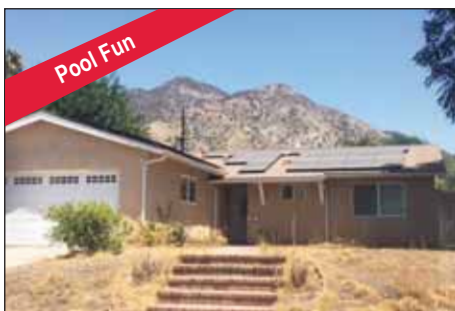
SYLMAR $749,947 Call 1-800-473-0599, Enter Code 2118