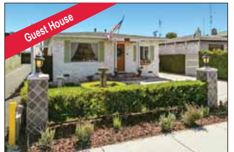
HAWTHORNE $799,997 Call 1-800-473-0599, Enter Code 2048