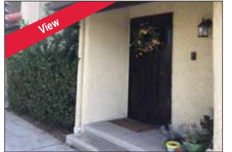
CABRINI VILLAS $599,995 Call 1-800-473-0599, Enter Code 3898