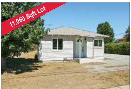
SIMI VALLEY $539,935 Call 1-800-473-0599, Enter Code 2258