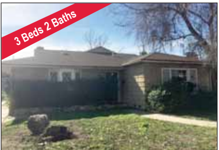
VAN NUYS $799,997 Call 1-800-473-0599, Enter Code 2688