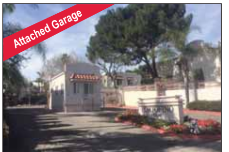
PACOIMA $449,944 Call 1-800-473-0599, Enter Code 2678