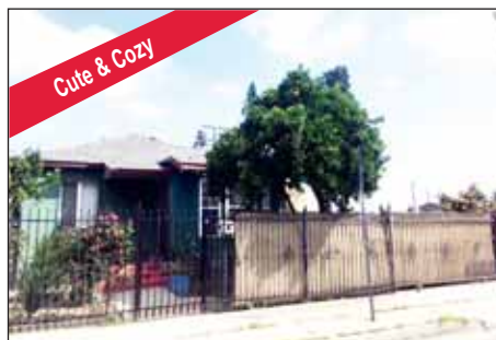
COMPTON $420,024 Call 1-800-473-0599, Enter Code 2888