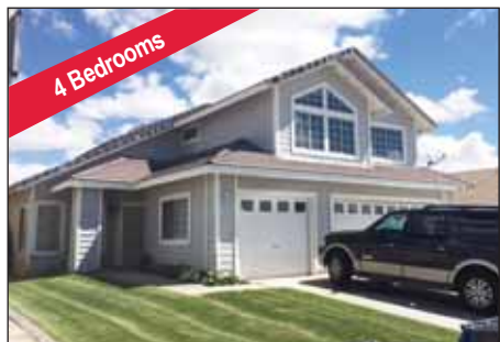
LANCASTER $529,925 Call 1-800-473-0599, Enter Code 2858