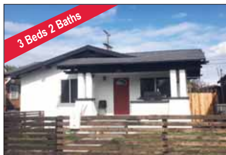
LOS ANGELES $619,916 Call 1-800-473-0599, Enter Code 2628