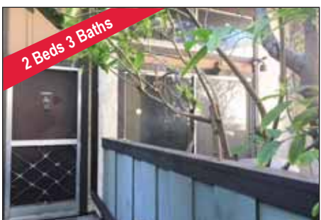
VAN NUYS $549,945 Call 1-800-473-0599, Enter Code 2948