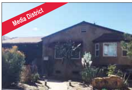
BURBANK $839,938 Call 1-800-473-0599, Enter Code 2598