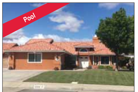
LANCASTER $589,985 Call 1-800-473-0599, Enter Code 2878