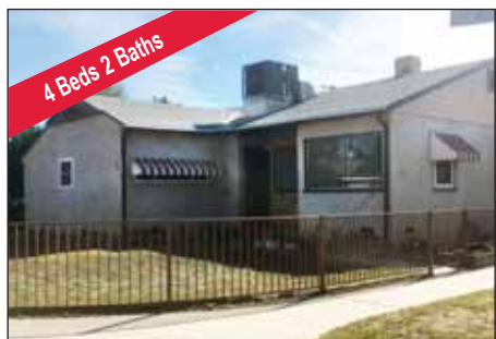
RESEDA $749,947 Call 1-800-473-0599, Enter Code 2648