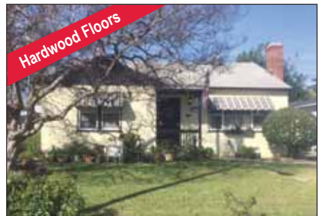
BURBANK $898,898 Call 1-800-473-0599, Enter Code 2818