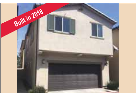
VAN NUYS $819,918 Call 1-800-473-0599, Enter Code 2828