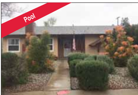
WINNETKA $849,948 Call 1-800-473-0599, Enter Code 2728