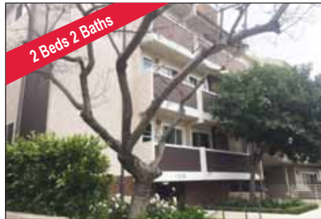
LOS ANGELES $925,529 Call 1-800-473-0599, Enter Code 2908