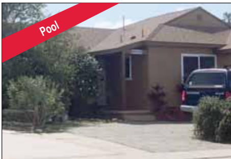
NORTH HOLLYWOOD $999,999 Call 1-800-473-0599, Enter Code 2738

Who said you can't get anything FREE today? All you do is buy or sell your home with us and you can reserve your date to use the truck the day of your closing. If you have a charitable or community project that needs a truck, call us, we'll let them use it FREE!