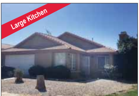
LANCASTER $434,434 Call 1-800-473-0599, Enter Code 3248