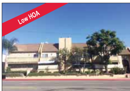
BURBANK $549,945 Call 1-800-473-0599, Enter Code 3358