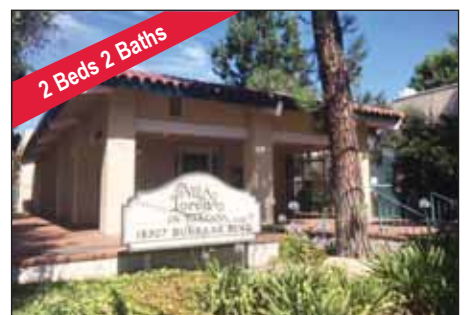
TARZANA $489,984 Call 1-800-473-0599, Enter Code 3158