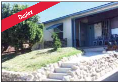
HIGHLAND PARK $719,917 Call 1-800-473-0599, Enter Code 3108