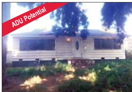
SYLMAR $649,946 Call 1-800-473-0599, Enter Code 3338