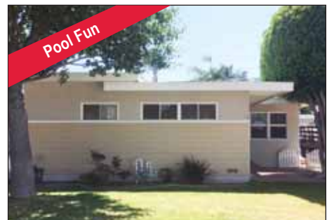
LONG BEACH $799,997 Call 1-800-473-0599, Enter Code 3128