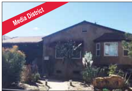
BURBANK $839,938 Call 1-800-473-0599, Enter Code 2598