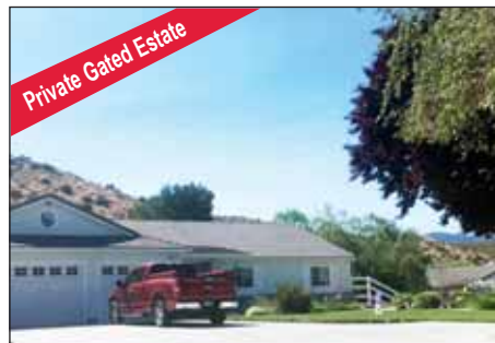
ACTON $849,948 Call 1-800-473-0599, Enter Code 3098