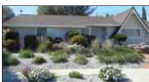
FEATURED HOMES Page 10-11