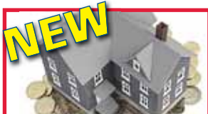
AREA MARKET TRENDS Page 12 NEW