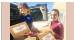
BURBANK NEWS Page 8