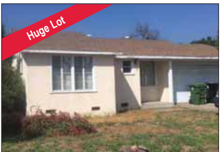
SYLMAR $669,966 Call 1-800-473-0599, Enter Code 3308