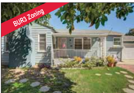
BURBANK $889,988 Call 1-800-473-0599, Enter Code 3258

Who said you can't get anything FREE today? All you do is buy or sell your home with us and you can reserve your date to use the truck the day of your closing. If you have a charitable or community project that needs a truck, call us, we'll let them use it FREE!