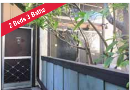
VAN NUYS $549,945 Call 1-800-473-0599, Enter Code 2948