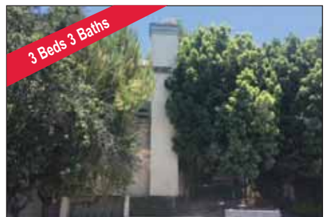
VAN NUYS $359,953 Call 1-800-473-0599, Enter Code 3298