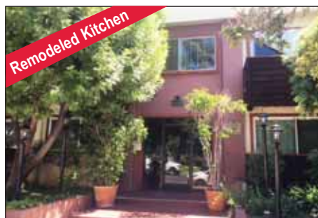
ENCINO $299,992 Call 1-800-473-0599, Enter Code 2438