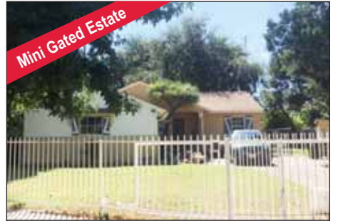
MISSION HILLS $599,995 Call 1-800-473-0599, Enter Code 2448