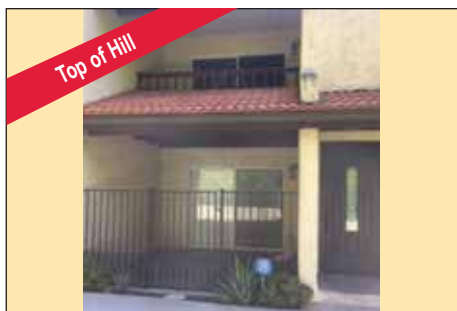
CABRINI VILLAS $555,555 Call 1-800-473-0599, Enter Code 2688