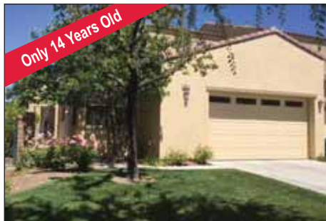
SANTA CLARITA $669,966 Call 1-800-473-0599, Enter Code 2048

Who said you can't get anything FREE today? All you do is buy or sell your home with us and you can reserve your date to use the truck the day of your closing. If you have a charitable or community project that needs a truck, call us, we'll let them use it FREE!