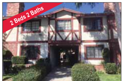
ARLETA $269,962 Call 1-800-473-0599, Enter Code 2878