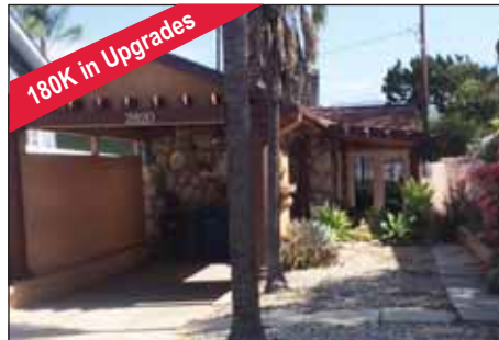
BURBANK $659,956 Call 1-800-473-0599, Enter Code 2628