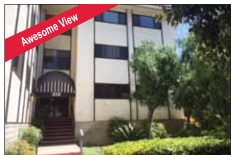
TOLUCA LAKE $539,935 Call 1-800-473-0599, Enter Code 2508