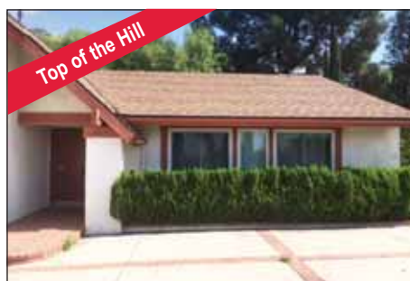
SYLMAR $549,945 Call 1-800-473-0599, Enter Code 2388