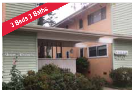
STUDIO CITY $499,994 Call 1-800-473-0599, Enter Code 2038