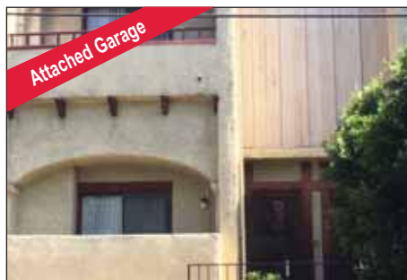
PANORAMA CITY $389,983 Call 1-800-473-0599, Enter Code 2728