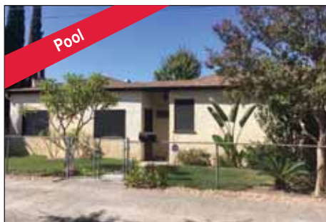
SUNLAND $519,915 Call 1-800-473-0599, Enter Code 2828