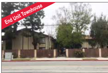
GRANADA HILLS $359,953 Call 1-800-473-0599, Enter Code 2178