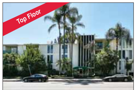
TOLUCA LAKE $479,974 Call 1-800-473-0599, Enter Code 2318