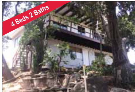
SHADOW HILLS $669,966 Call 1-800-473-0599, Enter Code 3178