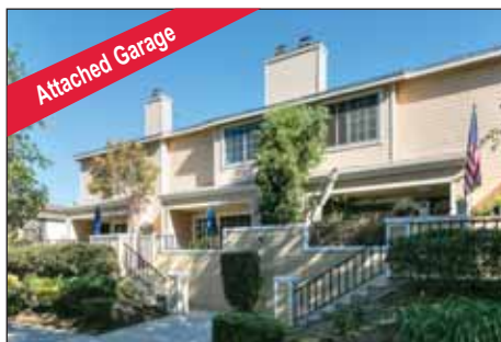
LAKE BALBOA $459,954 Call 1-800-473-0599, Enter Code 2888