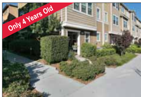
VAN NUYS $549,945 Call 1-800-473-0599, Enter Code 2698