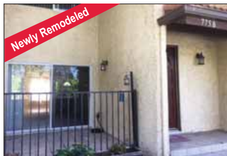
CABRINI VILLAS $489,984 Call 1-800-473-0599, Enter Code 2808