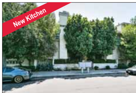
VAN NUYS $379,973 Call 1-800-473-0599, Enter Code 2908